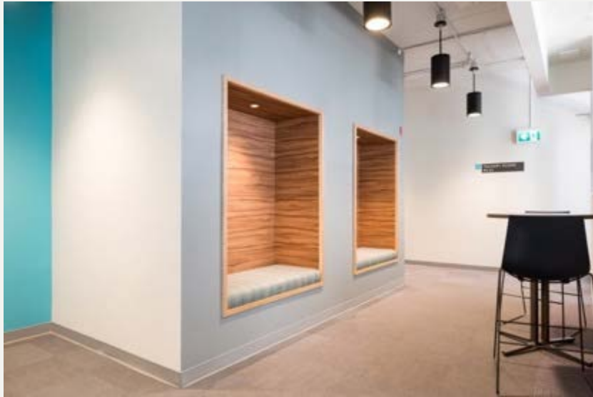
Youth cubbies for privacy