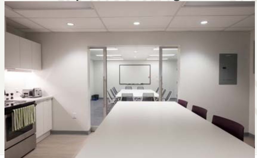
Kitchen to main Board Room