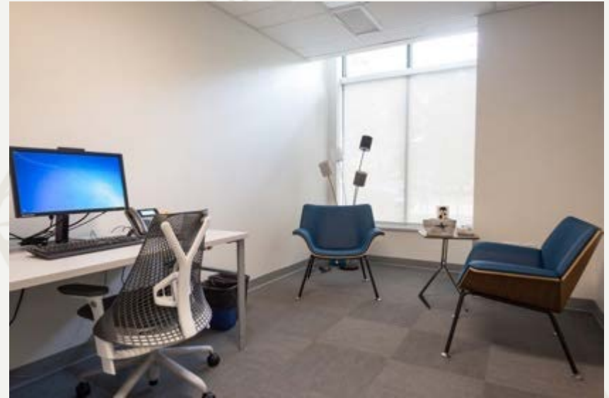
Drop In Counselling Rm