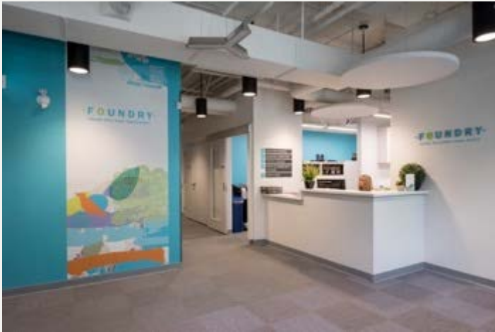
Foundry Front Reception